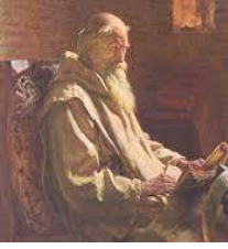
The Venerable Bede

St. Bede Episcopal Church Port Orchard, WA